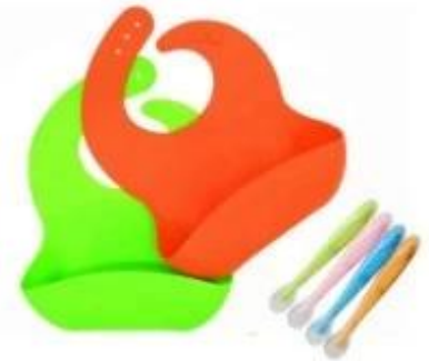
silicone baby bib+baby spoon