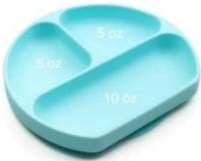
Silicone Grip Dish Placemat