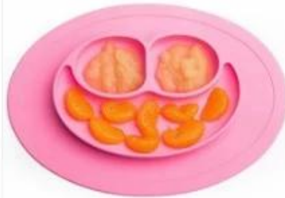
oval smily silicone placemat