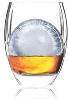
Cubo de hielo de silicona Bandeja similar / Molde de bola de hielo