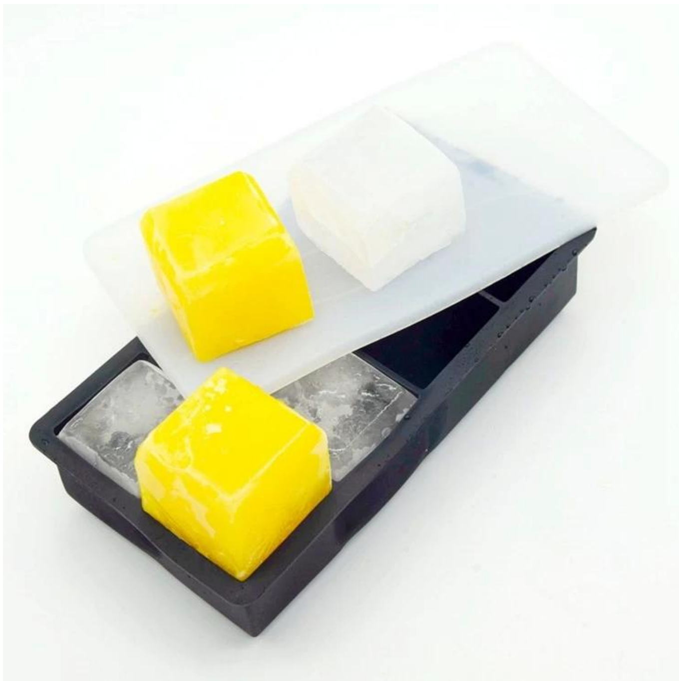
Bandeja al por mayor del cubo de hielo del silicón / molde de la bola del hielo