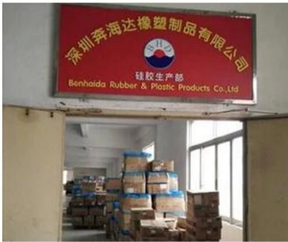
1. BHD Factory