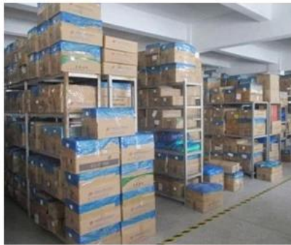
2. Raw Materials