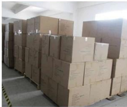
8. Packed products