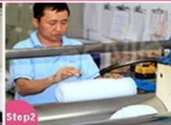
Step2 Material mixing and cutting