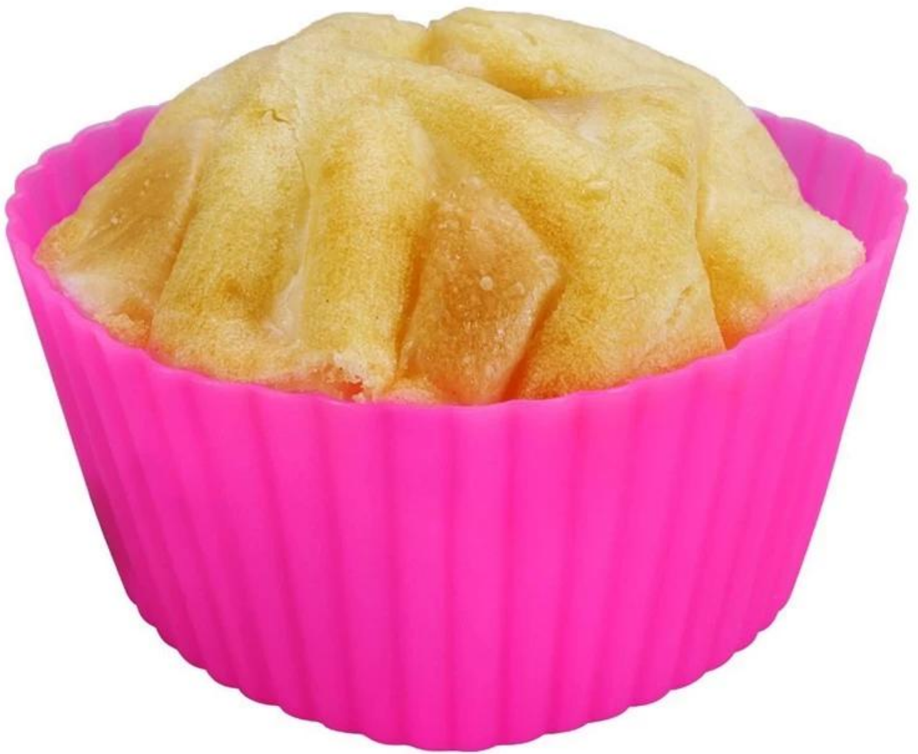
Jeans silicone muffin cupcake molds