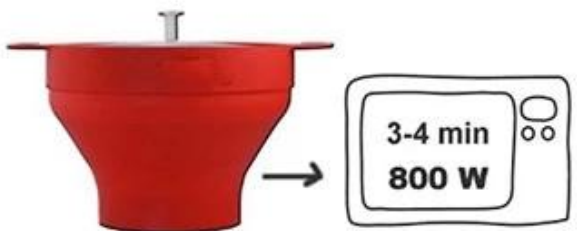
Collapsible Silicone Popcorn Maker