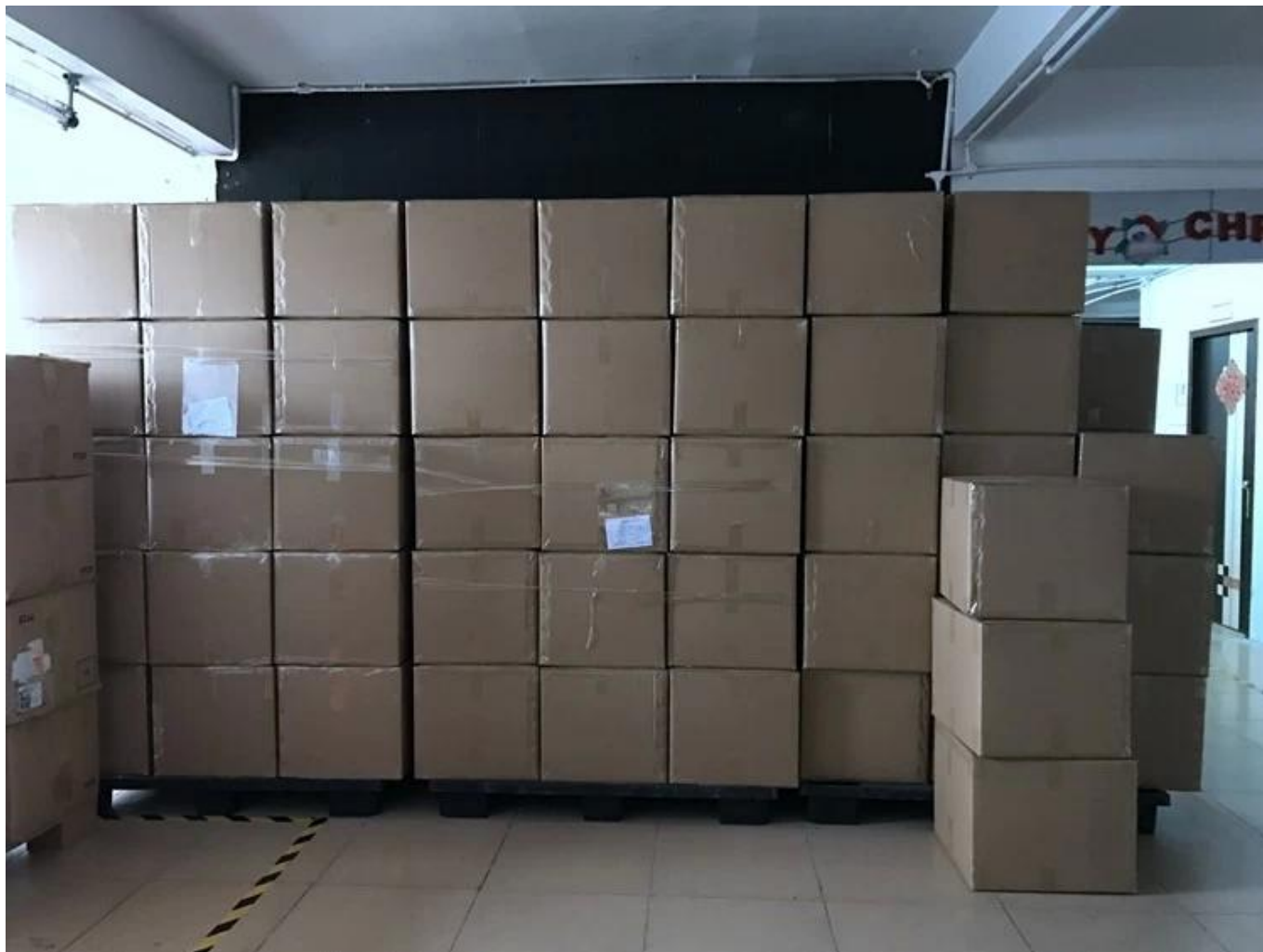
Pallet with plastic wrap