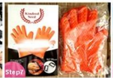
Step7 QC and Packing